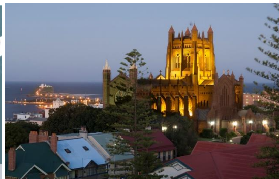
Figure 5: Newcastle NSW East End