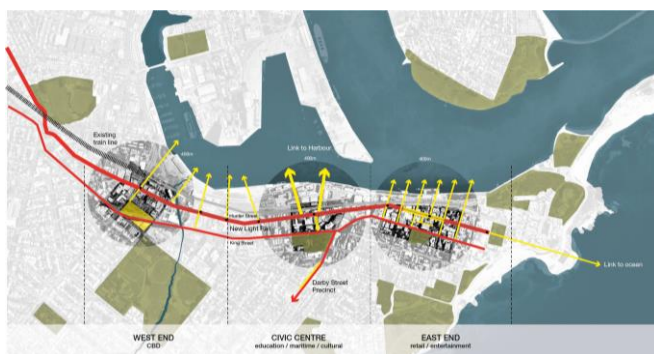
Figure 4: Newcastle NSW City Centre